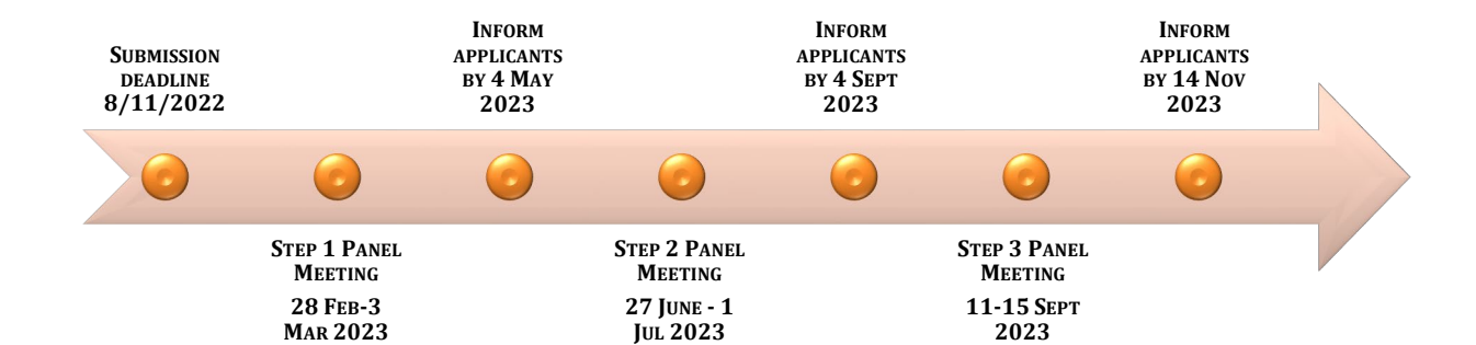
Figure 2: Timeline of the Synergy 2023 evaluation. The time to inform the applicants corresponds to indicative dates when the applicants receive the evaluation report. Successful applicants invited for step 3 interviews will receive their interview modalities at the end of July 2023.