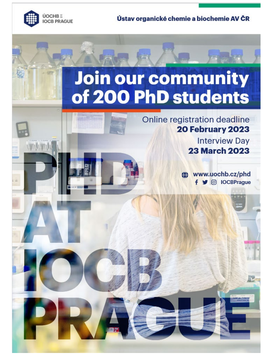
Flyer: PDF or print available by Martina

Slide sent to group leaders on January 11th