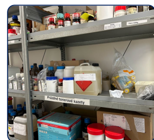
Rack for syringe needles, empty printer cartridges etc.