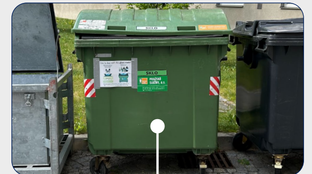
washed/evaporated bottles, jars, jugs