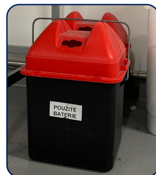
Container for batteries